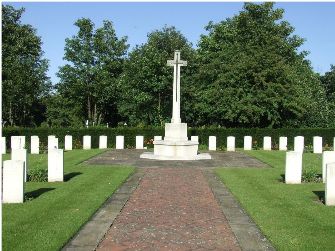
Islington Cemetery & Crematorium