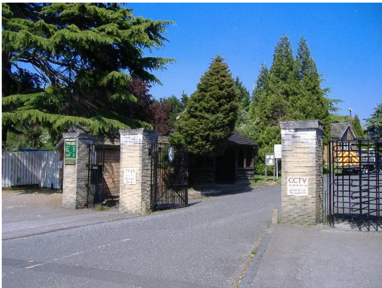
Islington Cemetery & Crematorium