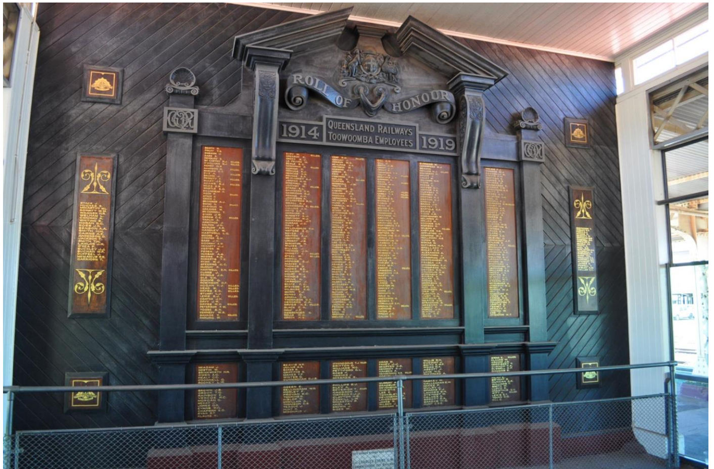
Queensland Railways Toowoomba Employees Roll of Honour