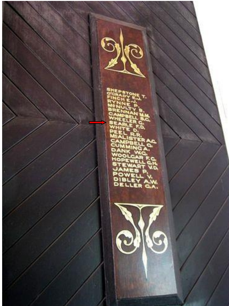
Queensland Railways Toowoomba Employees Roll of Honour