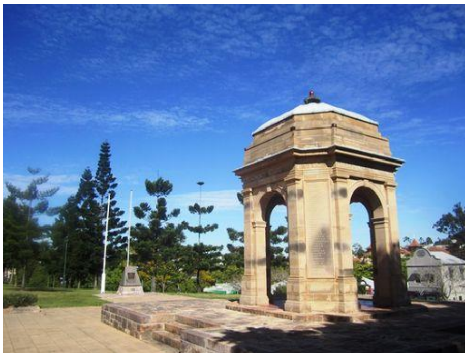
Windsor War Memorial