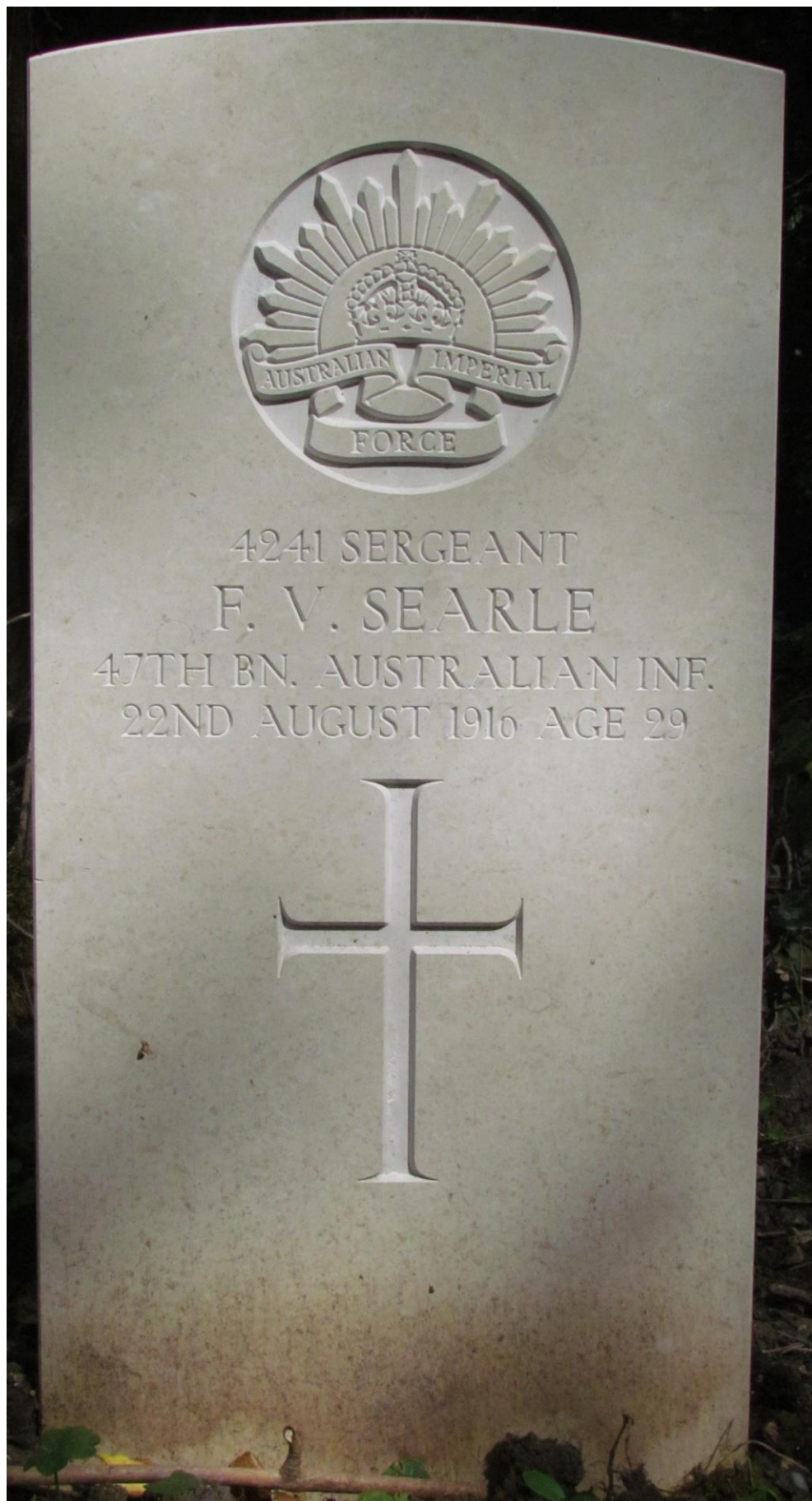
Photo of Private F. V. Searle's Commonwealth War Graves Commission Headstone in Islington Cemetery & Crematorium, Middlesex, England.