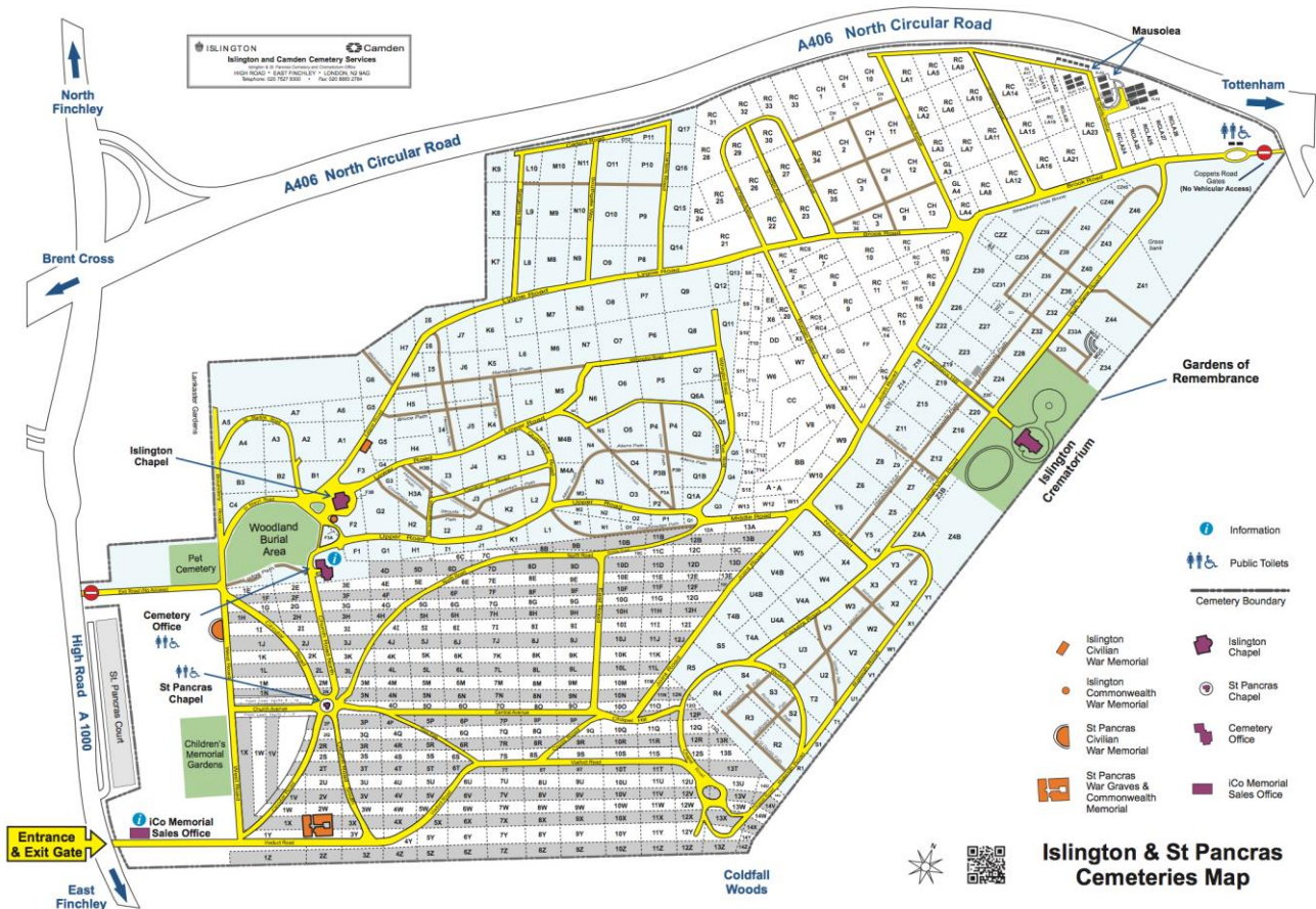
(Find a Grave – Lord & Lady Dodd)