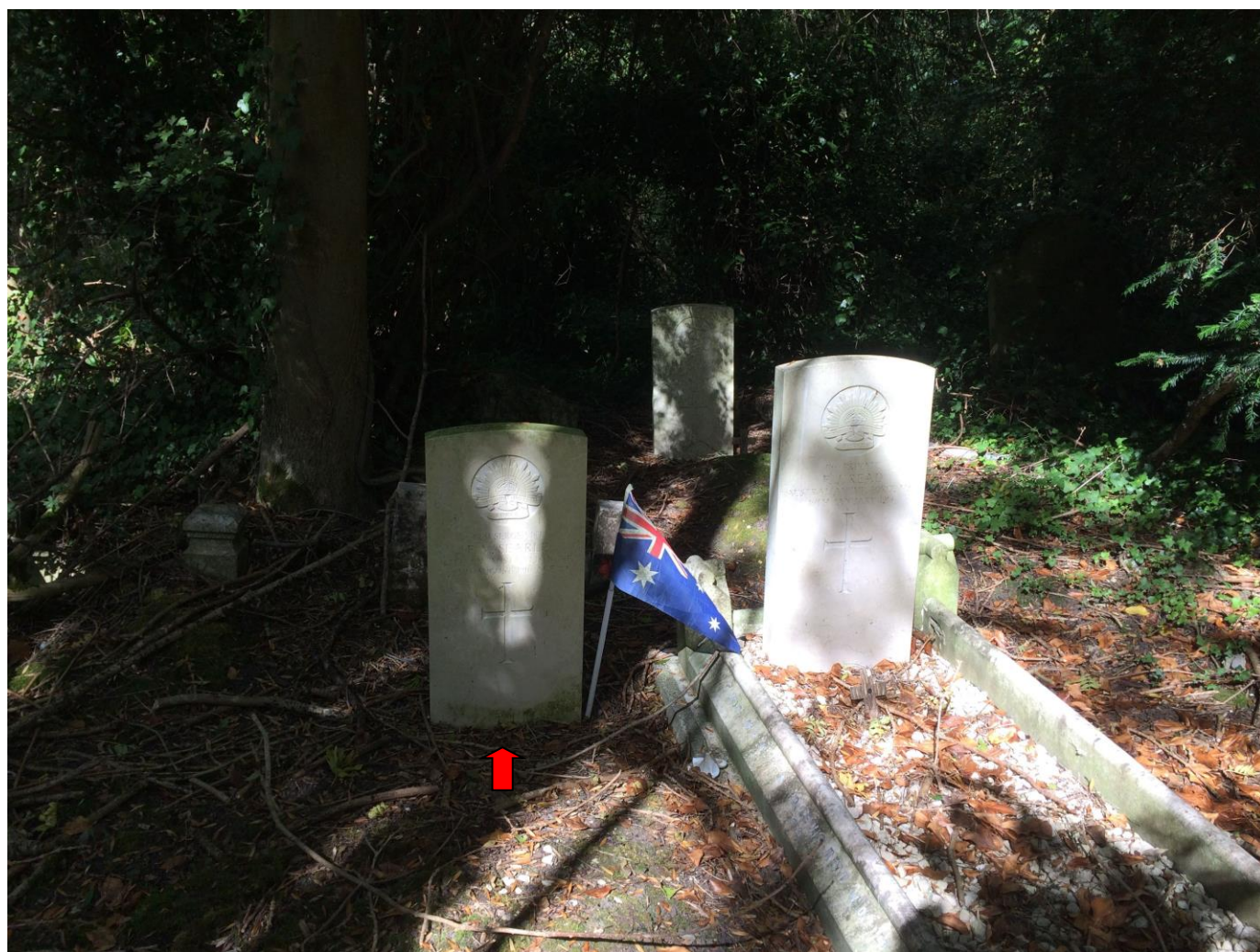
The two Australian WW1 War Graves in Islington Cemetery & Crematorium